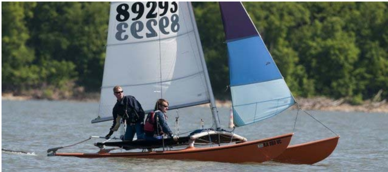
Enlarge photo.